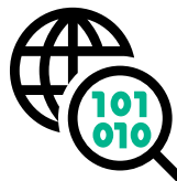
More data density