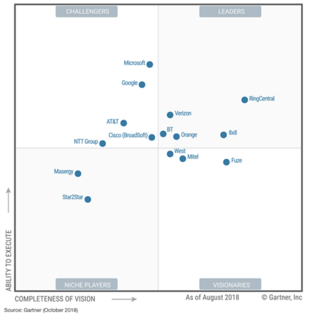
Figure 1. Magic Quadrant for Unified Communications as a Service, Worldwide